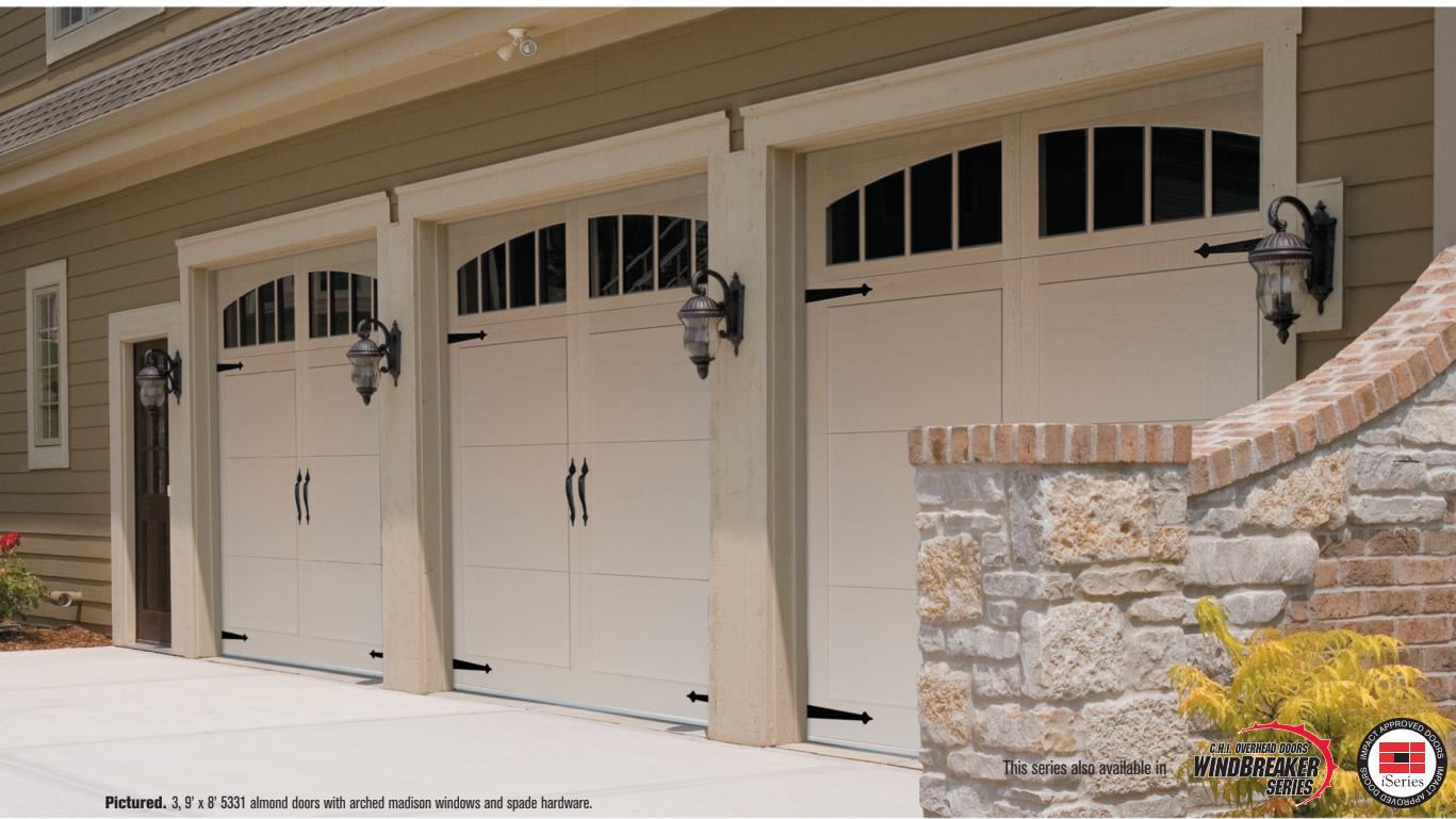
Pictured. 3, 9' x 8' 5331 almond doors with arched madison windows and spade hardware.

5300 Series. Utilizes a steel base sandwich section with a polystyrene core.