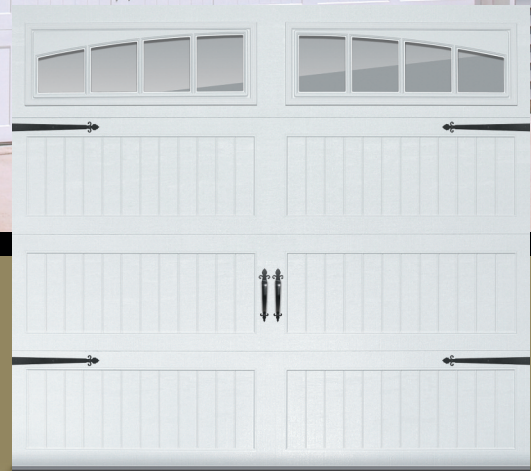
8' x 7' 5916 white with optional arched madison window inserts and barcelona hardware