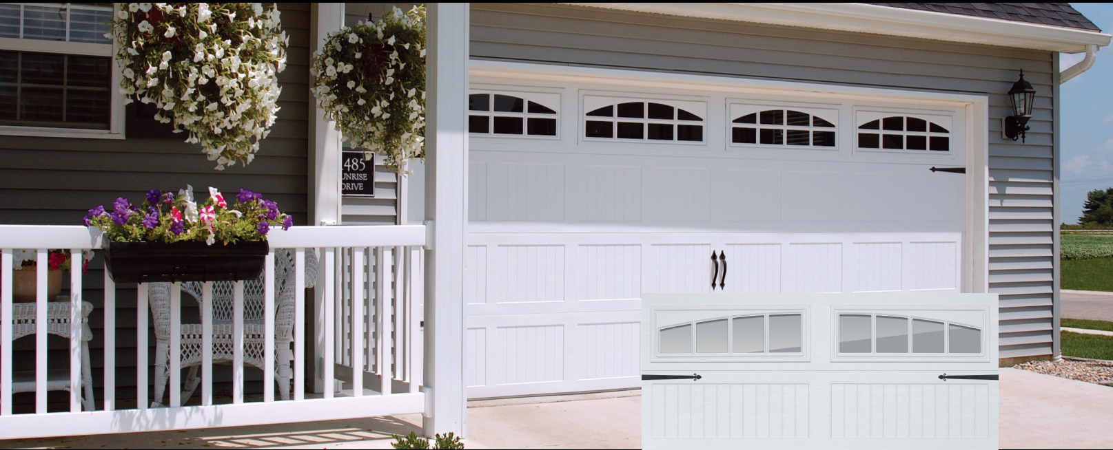
Pictured. 16' x 7' 5216 white door with optional cascade inserts and spade hardware